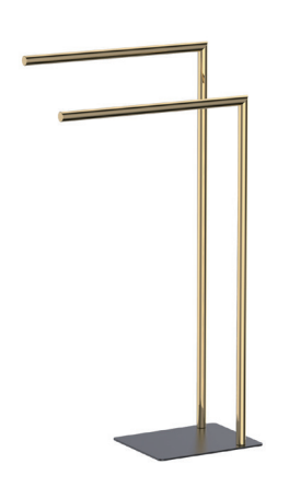
Article Code:10002 Freestanding double