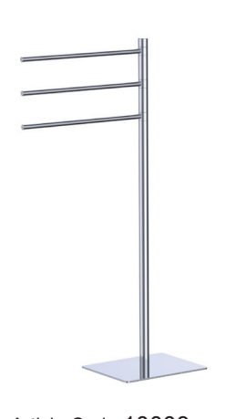
Article Code:10003 Freestanding towel holder