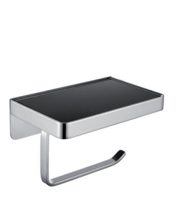
Article Code:8208 Paper holder with shelf