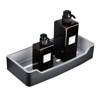
Article Code:7206 Bathroom square basket